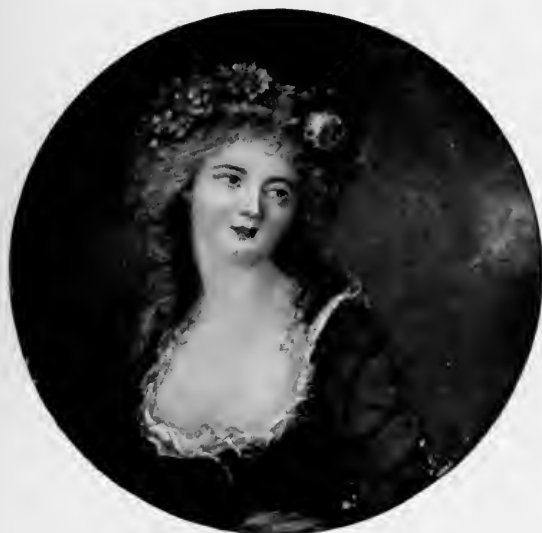
THE COUNTESS SOPHIE POTOCKI (Ob. 1822) BY P. A. HALL